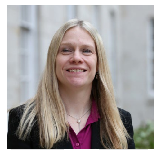
Professor of Sociolinguistics, University of Nottingham, UK

The sociolinguistics of identity, public sexual harassment and creating sustainable organisations